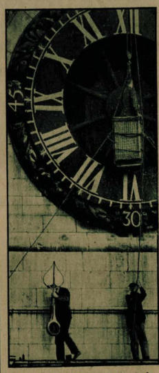
ROPES were necessary to steady the basket in the wind when workmen removed the hands of "Big Tom," the clock of St. Paul's Cathedral, for examination of the mechanism.