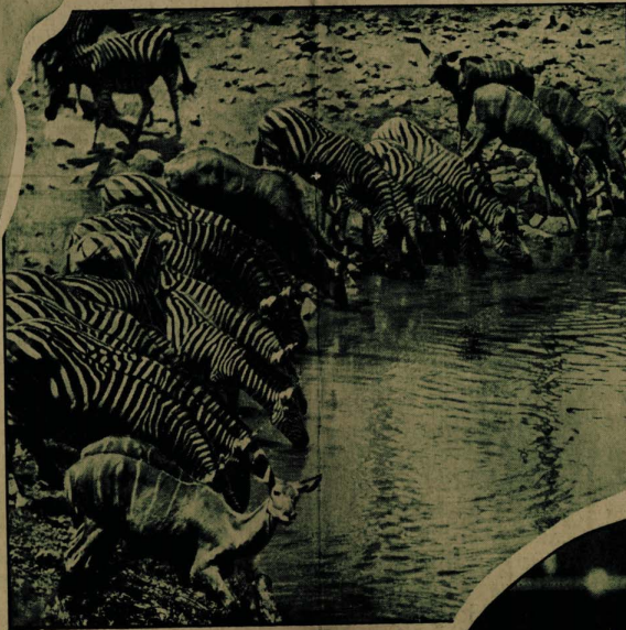
"OPENING TIME" in the bush. This remarkable picture of wild zebras and water buffaloes from Kruger National Park, the 220-miles long game reserve in South Africa. The photographer, carefully concealed for hours, waited until the wandering herd had been forced by thirst to the water hole.